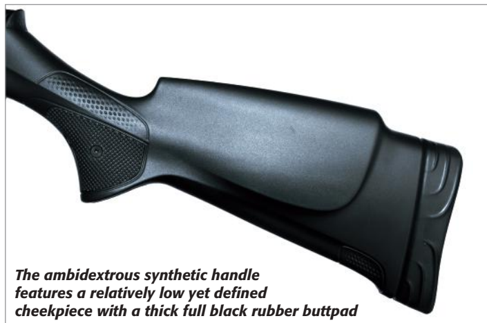
The ambidextrous synthetic handle features a relatively low yet defined cheekpiece with a thick full black rubber buttpad

chequering developed so far and one of a kind'. That's as may be but in plain speak the rifle is best described as using a combination of moulded rounded off oval shape stippling on the upper sections at both the grip and along the forend but also has removable grip insert plates on the lower sections at both areas. The standard black inserts as the rifle is displayed with have a very well-defined chequered outer finish – notice I refer to the colour as with the rifle you get two sets of replacement coloured