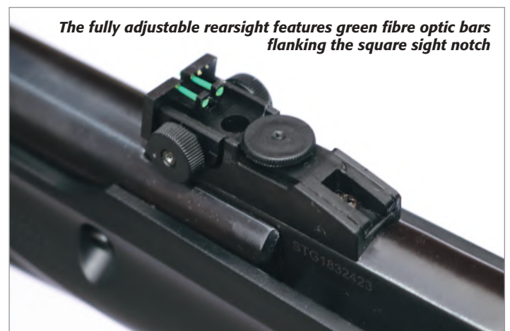
The fully adjustable rearsight features green fibre optic bars flanking the square sight notch