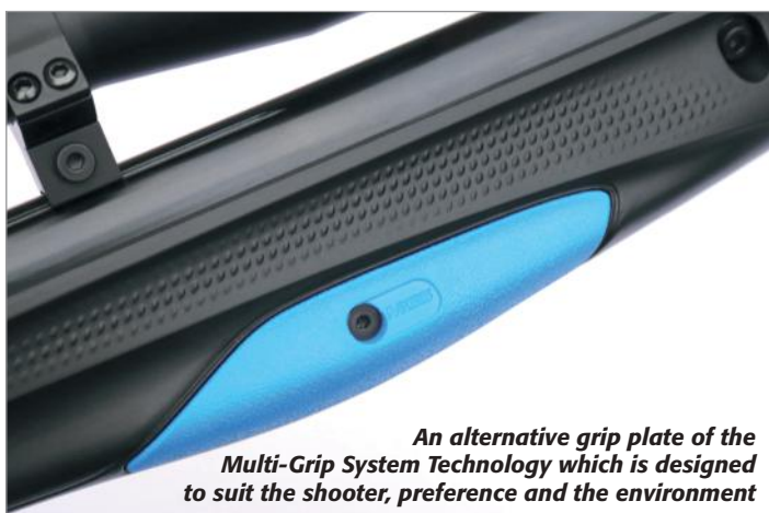
An alternative grip plate of the Multi-Grip System Technology which is designed to suit the shooter, preference and the environment