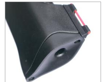
An interchangeable raised fibre optic foresight bar sits on top of the very efficient S3 Suppressor

Thanks to T & J. J McAvoy LTD for supplying rifle on test